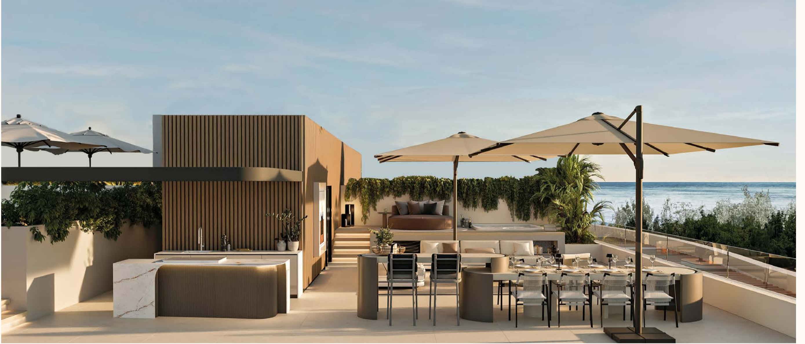
Perfect for family & friends gathering