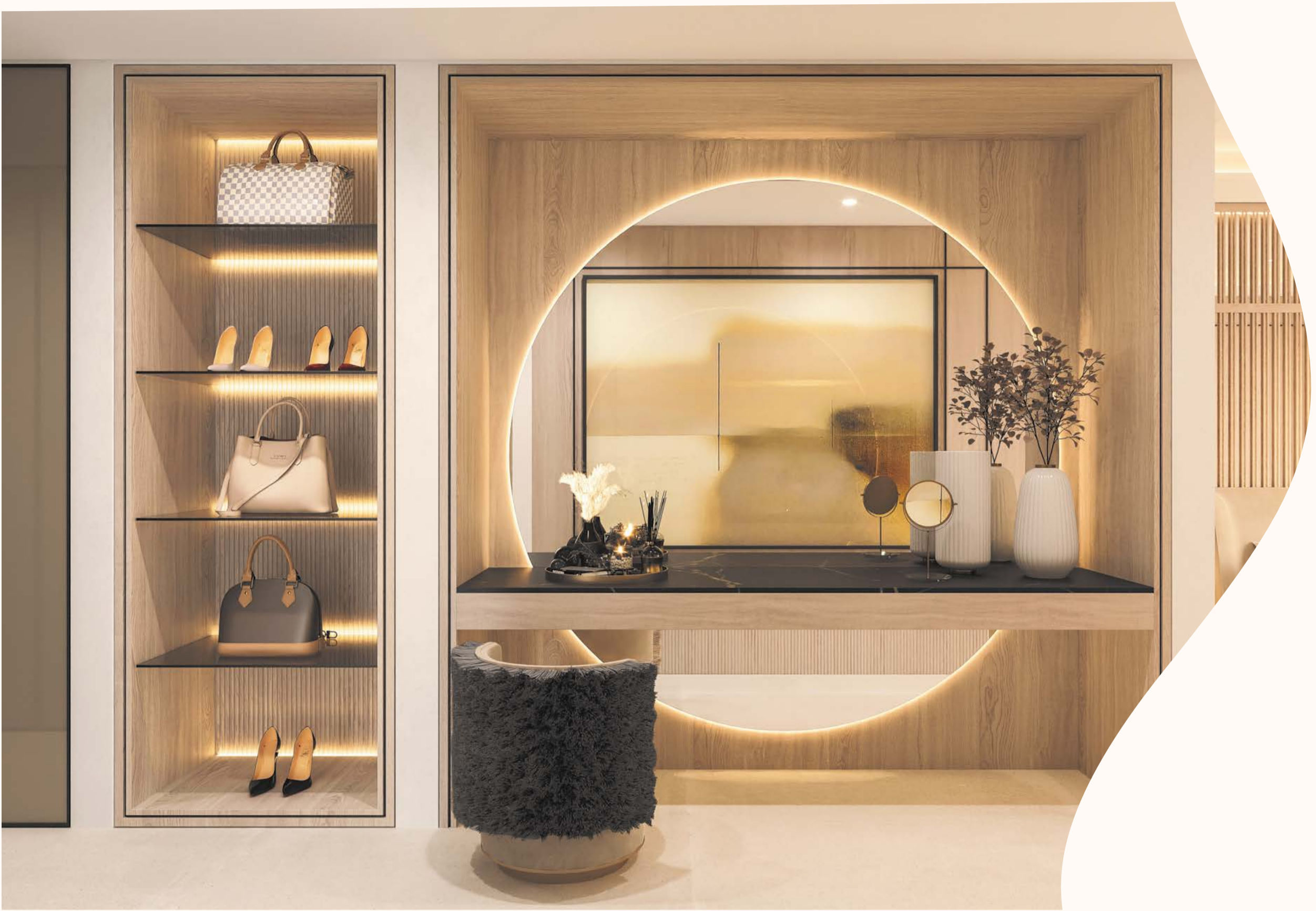
Warm & Modern Texture & simplicity