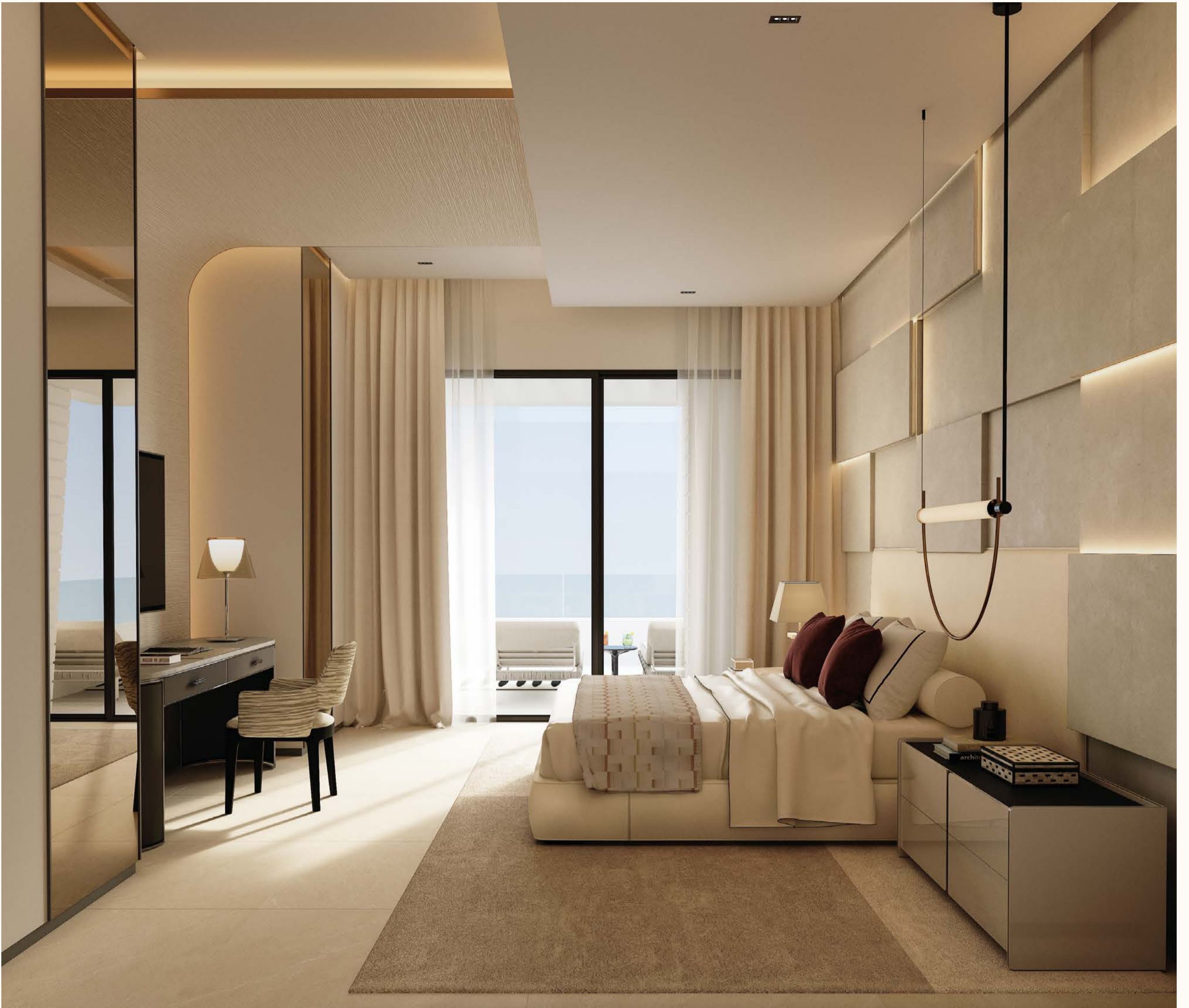
Spacious, clean lines and natural materials